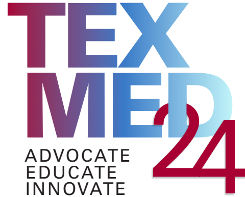
EXHIBIT BOOTH DETAILS

TexMed sponsors and exhibitors will receive a tabletop display prominently located in the center of all TexMed conference and event activities. Physician attendees register and enjoy coffee breaks, meals, social networking, and CME while interacting with TexMed exhibitors and sponsors.